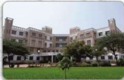
SDM College of Physiotherapy & SDM Institute of Nursing Sciences