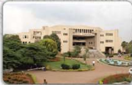
SDM College of Medical Sciences & Hospital