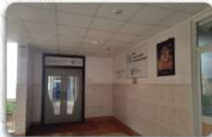
SDM Research Institute for Biomedical Sciences