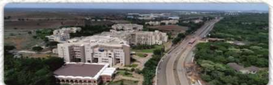
Panoramic View of Campus