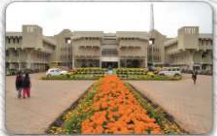
SDM College of Dental Sciences & Hospital