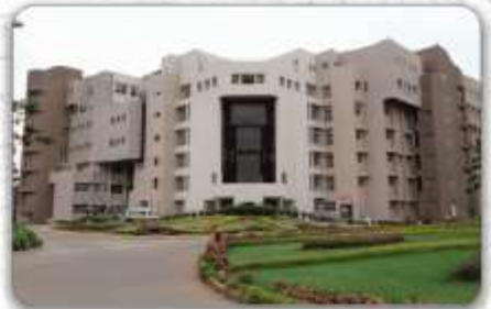
Shri Dharmasthala Manjunatheshwara University